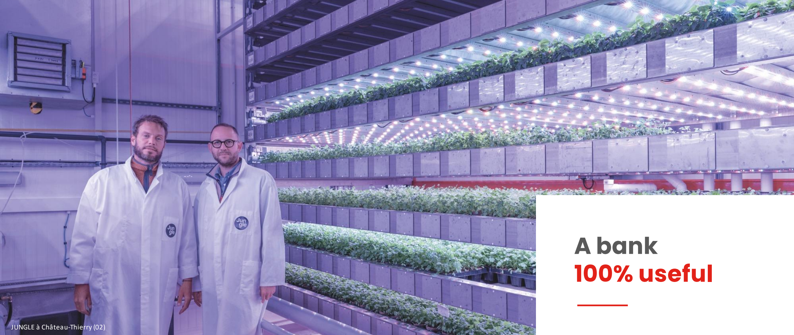
JUNGLE à Château-Thierry (02)