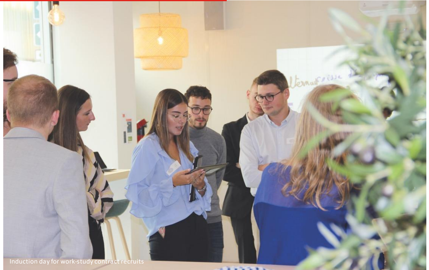
Induction day for work-study contract recruits