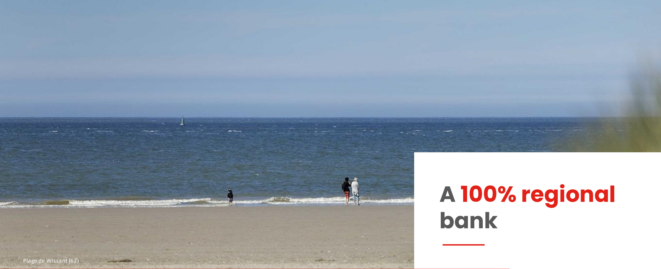
Plage de Wissant (62)