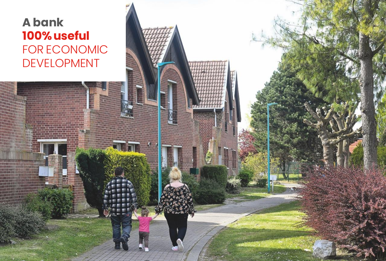
The Haut Terroir residence in Waziers

A bank 100% useful FOR ECONOMIC DEVELOPMENT